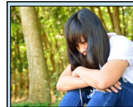
Should we be surprised that 9 out of 10 young people in Britain believe their lives have no purpose?

Another consequence of belief in evolution is the view that humans are a recent arrival on earth, which has led to people like Sir David Attenborough claiming the world would be better off without us. However, the Bible clearly teaches that the earth was primarily created as a home for humans, so decisions about climate change, etc., should prioritise the needs of humans, while still caring for the whole of God's creation.