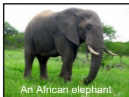
An African elephant

"Female elephants in Mozambique rapidly evolved to become tuskless as a result of intense ivory poaching during the country's civil war, even though one of the mutations involved kills male offspring", reported New Scientist (21st October 2021). During the country's civil war (1967-1992) both sides hunted elephants for their ivory, and the proportion of tuskless females rose from 19 to 51 per cent. "This loss of tusks due to ivory hunting or poaching has happened in many other places too. For instance, in Sri Lanka less than 5 per cent of male Asian elephants still have tusks." Researchers believe that two mutations are responsible for this.